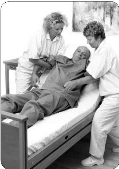
Manually lifting a patient higher up in bed is heavy and strenuous work. It is an operation associated with risks and often repeated many times during the day for each patient.