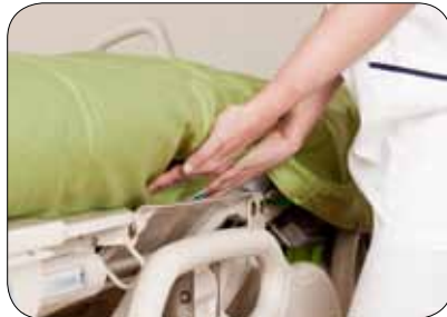
RepoSheet Original is easily placed in the bed. It is soft to lie on and can be used in combination with and instead of an ordinary bottom sheet.