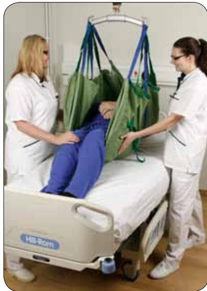
When the patient has been lifted from the bed, he is easily moved higher up with the help of the RepoSheet – all with minimal physical effort.