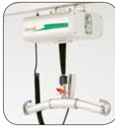
Liko has a wide range of over-head lifts. Likoall is one of several good alternatives in combination with RepoSheet.