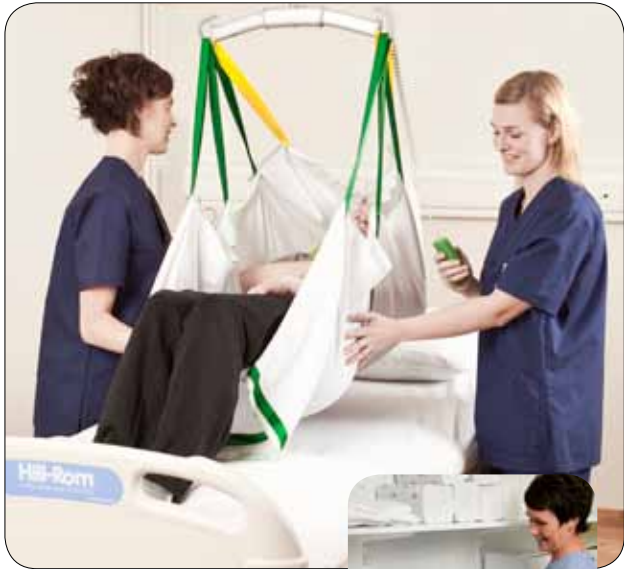
Solo RepoSheet is placed on top of the ordinary bed sheet and can be used during the entire care period. Since laundering is eliminated, the Solo RepoSheet solution is relatively economical, while necessary aids can be held available in storage.

The Solo RepoSheet is a variant of the RepoSheet, intended for short-term use. The Solo RepoSheet should not be washed, but should be disposed of when soiled or when the patient no longer needs it.