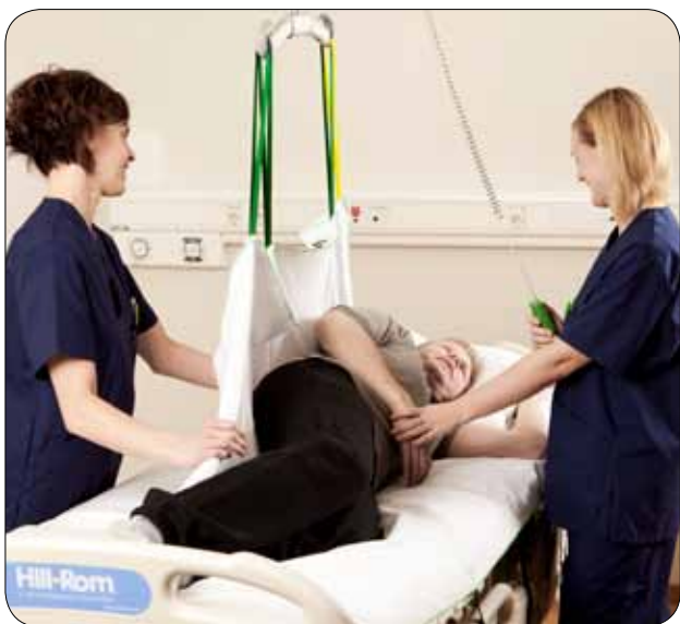
Using the Solo products from Liko helps to prevent the spread of viruses and contagious bacteria, e.g. MRSA.