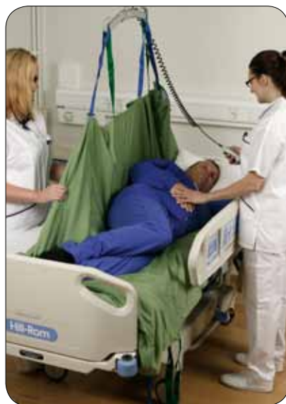
With the help of the overhead lift, turn the patient to the side in a careful and controlled manner.