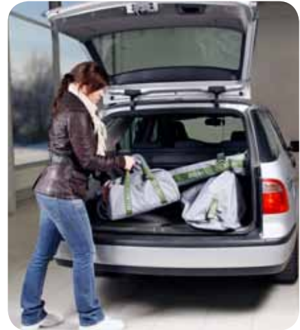
Easy to bring on the trip.