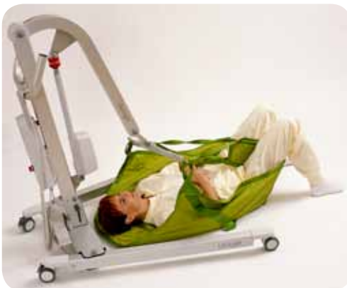
Manages all common lifting situations, including lifts from the floor.