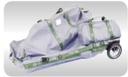
Accessory: LikoLight Travel Bags.